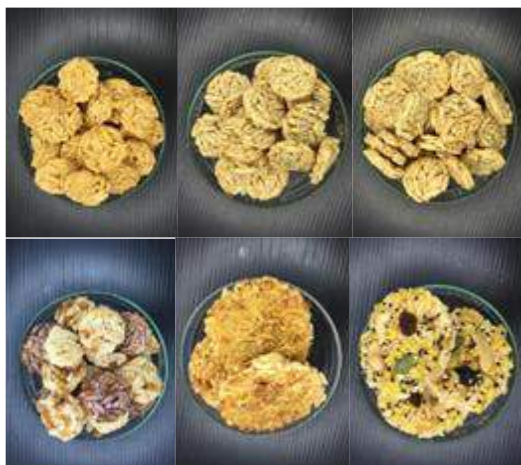
Figure 1. Khao Tan samples.

There are many kinds of Khao Tan products in Thailand. After collecting product samples, the expert team selected 6 popular flavors of Khao Tan, namely, Tomyam (Thai spicy style), Wasabi (Japanese style), Seaweed, Sugarcane, Shredded pork and Seed&Cashew nut as shown in Figure 1.